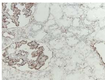
IHC-F: Immunohistochemical analysis of Ficolin-2 in frozen rat kidney tissue using mAb GN4 (Cat.# HM2090).

N.D.= Not Determined; IHC = Immuno histochemistry; F = Frozen sections; P = Paraffin sections; IF = Immuno Fluorescence; FC = Flow Cytometry; FS = Functional Studies; IA = Immuno Assays; IP = Immuno Precipitation; W = Western blot